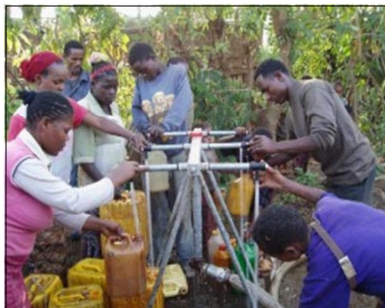
Women and children taking water from drilled well

no access to places to study when they go home after school hours. The simple and unfortunate fact is that the girl children are less considered when it comes to (Continued on page 4)