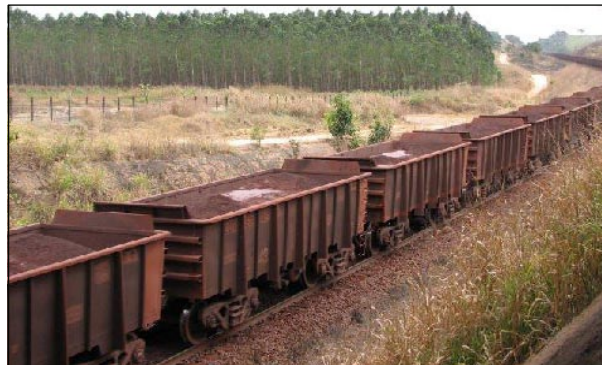
Justice for the land wounded by the Brazilian mining giant Companhia Vale do Rio Doce

The first international meeting of the people affected by Vale will take place next April. Representatives from Brazil, Peru, Ecuador, Argentina, Chile, Canada, Mozambique, Italy and - possibly - Indonesia will get together for a three-day 'popular court', in which they will exchange information, expose to the media the hidden face of the company and interrogate Vale's directive board and stakeholders. The Brazilian Network of Environmental Justice ('Rede Brasileira de Justiça Ambiental') together with other big and small entities from Brazil will then deepen an important alliance with the Observatory of Mining Conflicts in Latin America (Observatorio de Conflictos Mineros em America Latina) and with international unionist networks from