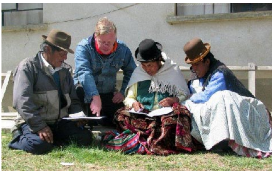
VIVAT members work to promote the value of respect for human life in all peoples and cultures, based on the conviction that an authentic people is one that knows how to respect and care for the most defenseless and fragile life.

niversary of the Copenhagen Declaration. The statement advocates for a "Society for All", encouraging governments to adopt policies and practices to promote the empowerment of all peoples. The statement goes on to emphasize the need of empowerment in order to eradicate poverty, among other goals of the Commission on Social Development, and concludes urging gov-