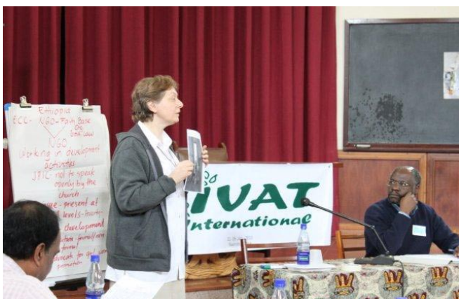
VIVAT member from Middle East presents report.

VIVAT Executive team and JPIC Coordinators also designed and facilitated a half day program for people undergoing formation. The participants were from the founding, member and associated congregations. The program included input on the importance of JPIC already in the initial formation. Most of them were having their first contact with VIVAT's history, mission and vision and their participation and contribution indicate that they are a great asset to make VIVAT truly an areopagus of the modern day in their local situation.